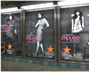
Karl Lagerfeld for Impulse, only at Macy's, in the Times Square subway station