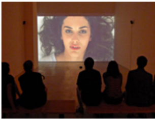
Aida Ruilova's Goner (2010), unspooling at Salon 94 Bowery