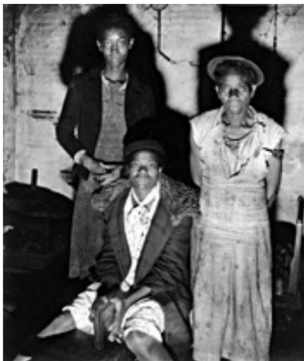
Peter Sekaer, Nashville, 7th Ave., 1939 , High Museum of Art, in "Signs of Life: Photographs by Peter Sekaer" at the International Center of Photography, © Peter Sekaer Estate