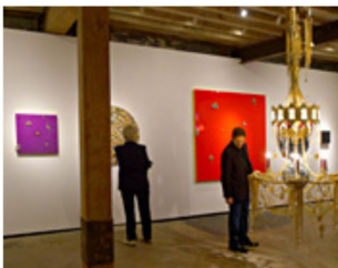
Dzine's "Imperial Nail Salon" at Salon 94 Freemans