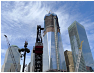
Freedom Tower, center, rising at Ground Zero in Lower Manhattan, September 2011