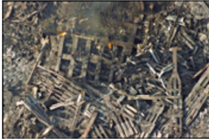
Gregg Brown, [Iron workers cut the remaining structure of the North Tower, 12/16/2001], from "Above Ground Zero," in "Remembering 9/11" at the International Center of Photography, © Gregg Brown